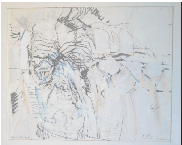
Samuel Beckett

Admission to the exhibition is free. Call the Brooklyn Central Library for details at 718-230-2100.