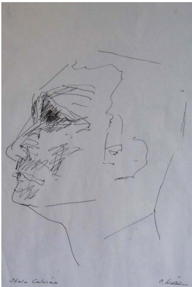
[From top: Samuel Beckett; Joyce Carol Oates; R.M. Rilke; Italo Calvino]

BOOKMARK Comments (7) Send to a friend Permalink